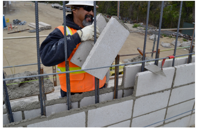
Figure 2—Open-Ended Block Facilitates Placement Around Vertical Reinforcement

As part of a building's exterior envelope, single-wythe concrete masonry construction serves the dual role of providing both enclosure and structural strength. As such, these assemblies almost always contain reinforcement and grout. While the reinforced cells of an assembly increase the strength of the system, the grout provides a larger area for heat flow, creating a larger 'thermal short' within the assembly. The net result is a decrease in the steady-state R-values. The numerical impact of grouting on R-value varies directly with the amount of grout in the wall.